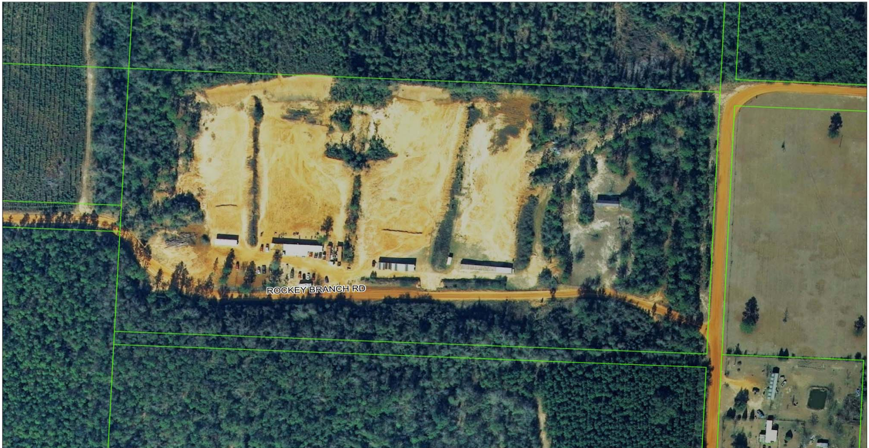
ESCAMBIA MUZZLE LOADER SHOOTING RANGE 2009 PHOTOGRAPHY